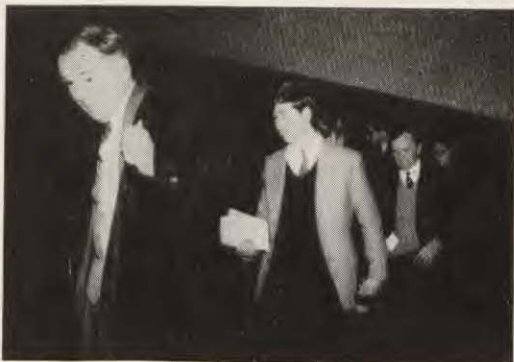
“By Appointment . . .”

One of the most interesting and provocative questions facing a modern theatre in which dramatic form is breaking down is to what extent the development of a philosophical argument can create the basis for a cogent drama. Sartre was central in exploring the possibility of Existentialist dialectics as the skeleton for theatrical form. He only partially succeeded and in the end his dramas are interesting and important not because they are theatrically effective but because they engage in an exploration of Existential dilemmas.