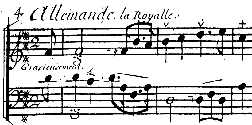
Example 3: Hotteterre, Allemande La Royale from Pièces (Op. 2) 1715, bars 1-2.