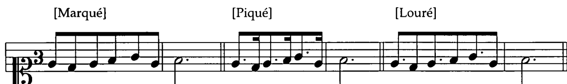
Example 6: Loulié, Supplément des Principes ou Elémens de Musique .

In his definition of notes inégales Fuller also states that this 'rhythmic convention...is independent of questions of notation', and elsewhere that 'there was no clear boundary between dotted rhythms, whether exaggerated or not, and notes inégales '. 38 Hotteterre sometimes writes the dots and sometimes does not,