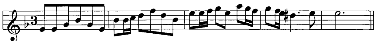
Example 8: Hotteterre, Couplet de la Passacaille d'Armide in L'Art de preluder , p.58.