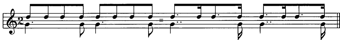
Example 4: Synchronization of notes inégales following Hotteterre's explanations.

From the above evidence we can conclude that for Hotteterre a dot after a note, whether written or added by the performer, creates a degree of inequality between the lengths of the long and short notes of each pair that can be expressed as a ratio of 3:1 (3 semiquavers to 1 semiquaver in a pair of quavers—see Examples 2 and 3). In the case of double dotting, the ratio is 7:1. This also has the effect of making the short quavers (the semiquavers) synchronise. 29 So a passage of music which had one line moving in equally notated quavers with another line moving in dotted crotchet-quaver rhythm can be written, following Hotteterre's explanations, as in Example 4. 30 Example 5 shows how Hotteterre could have continued the passage quoted in Example 3 to indicate the inequality and synchronization of semiquavers.