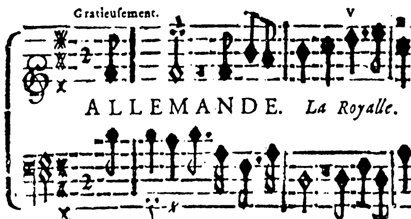
Example 2: Hotteterre, Allemande La Royale from Pièces (Op. 2) 1708, bars 1-2.