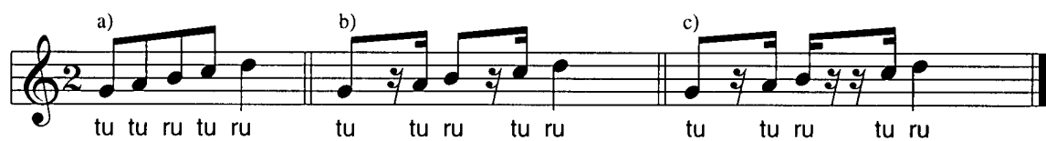
Example 12: Articulation silence with tu ru (normal form).