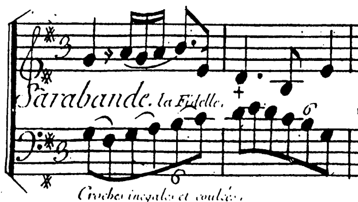
Example 10: Hotteterre, Sarabande La Fidelle from Pièces (Op. 2) 1715, bars 1-2.