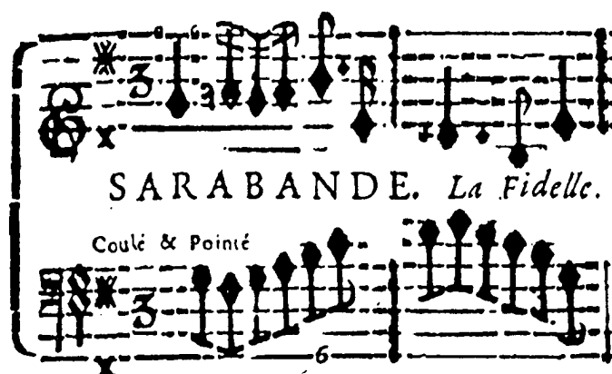
Example 9: Hotteterre, Sarabande La Fidelle from Pièces (Op. 2) 1708, bars 1-2.

Various authors have put forward the view that there is a relationship between Hotteterre's articulation syllables ( tu ru ) and inequality. 45 Others have gone a step further and argued that the use of tu ru causes inequality. 46 However, Fuller argues against this view, saying: