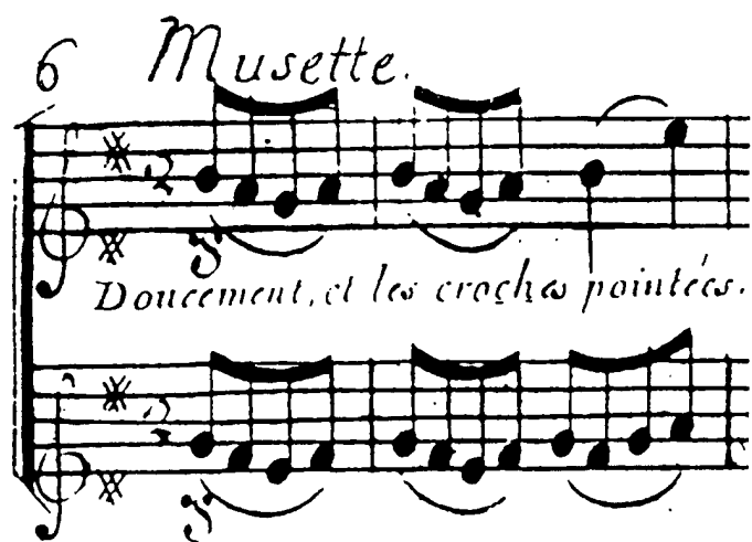
Example 11: Hotteterre, Musette from Deuxième suite de pièces à deux dessus ... Oeuvre VI ème (1717).