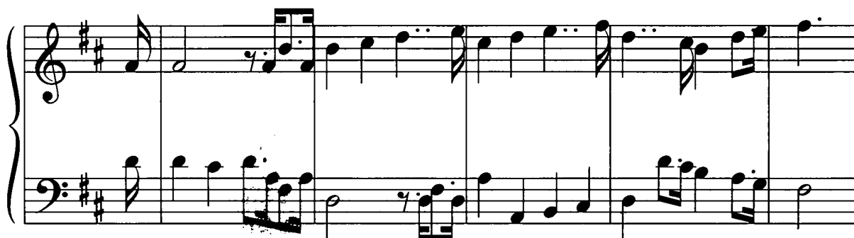
Example 5: Hotteterre, Allemande La Royale from Pièces (Op. 2) 1715, bars 1-4.