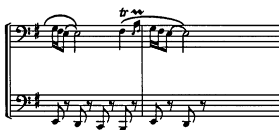
Example 1: Gerald Finzi, 'When I set out for Lyonesse', bars 3-5.