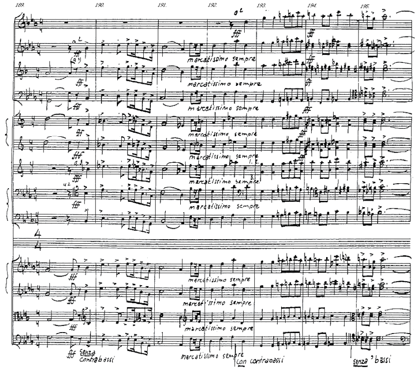
Figure 4. Andriessen, De Negen Symfonieën van Beethoven 23, bb. 189–95

An overt representation of this connection between The Nine Symphonies of Beethoven and Andriessen's belief in the need for social, political and cultural renewal is provided by his brief quotations of L'Internationale (bb. 190–92) and the Dutch National Anthem (bb. 193–95) (Fig. 4). The anthem of the First, Second and Third Internationals, conferences of members of the labour force, L'Internationale was also the national anthem of the Soviet Union until 1944, and remained synonymous with socialist and communist political ideals during the 1960s. The conflation of the two anthems suggests Andriessen's belief in the need for continued