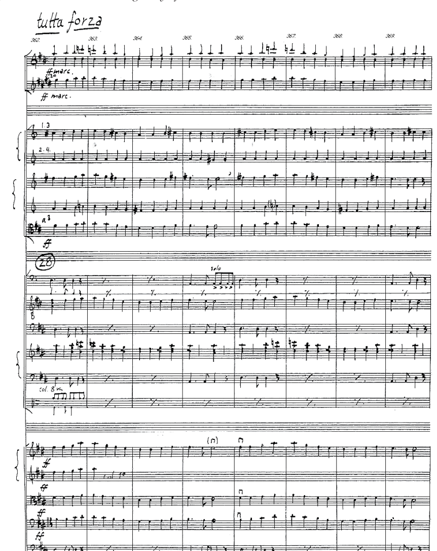
Figure 5. Andriessen, De Negen Symfonieën van Beethoven 48-49, bb. 362-69.

to contemporary music derived from stylistic combination and integration. Interpreted in this way, The Nine Symphonies of Beethoven was to prove prophetic, as it was Andriessen's refinement of such stylistic integration that was to prove fundamental to subsequent projects such as De Volharding and De Staat .