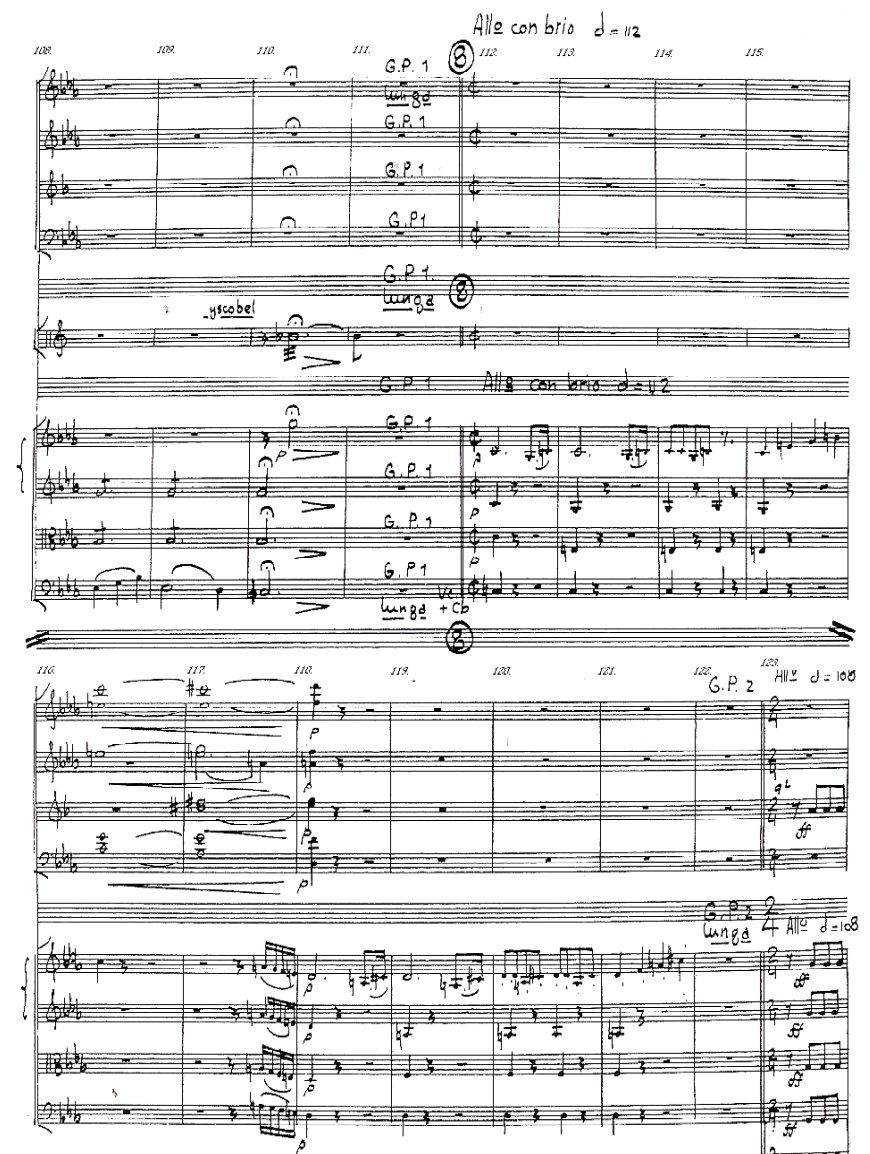
Figure 3. Andriessen, De Negen Symfonieën van Beethoven 16–17, bb. 108–23

violin I part whilst continuing all other parts as written (bb. 315–16), Andriessen disjoints the melody and accompaniment, causing a momentary loss of cohesion which is further emphasised by the insertion of two extra bars. The subtlety of this subversion is confirmed by the fact that the disjunction is only temporary, with the original quotation being restored after six bars.