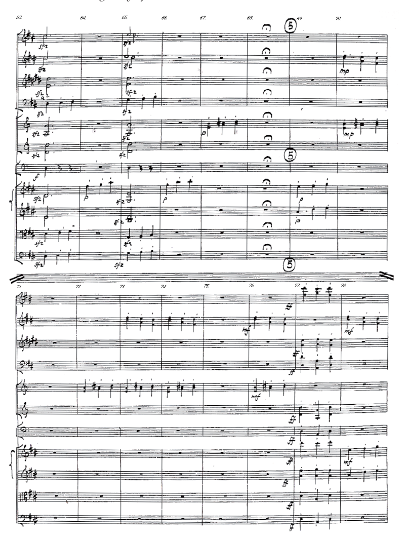
Figure 2. Andriessen, De Negen Symfonieën van Beethoven 12, bb. 63-78

Contrasting this structural distortion of the quotations from the First Symphony, Andriessen undermines the quotation from the third movement of the Symphony no. 2 through melodic variation. Following twenty-one bars of unaltered quotation (bb. 47–67), the scherzo comes to a halt to allow a further nineteen bars of fragmentary phrases derived from the original material (Fig. 2).