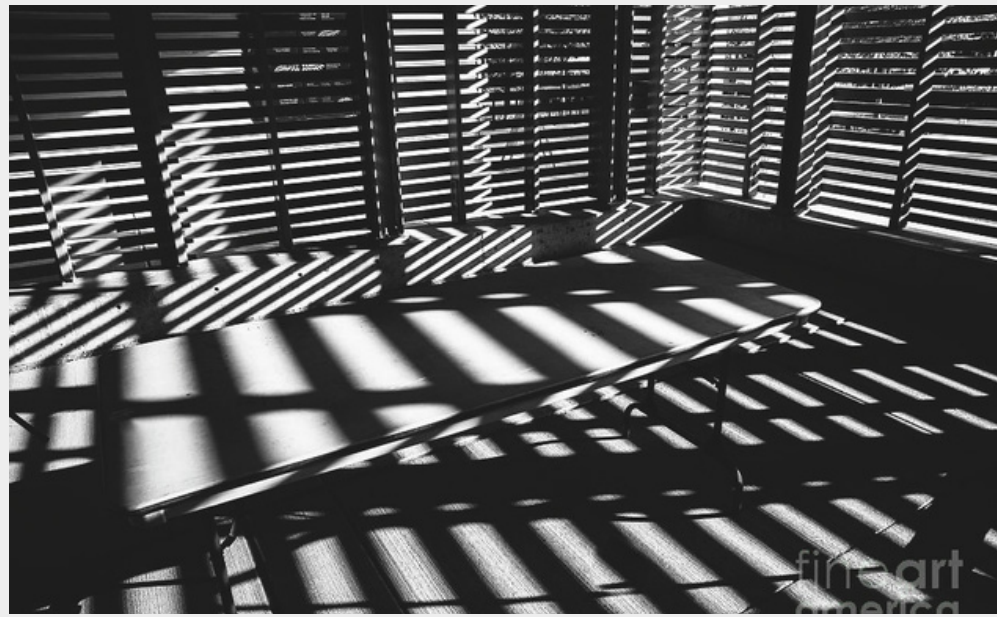
Abstract Light Patterns: Jim Corwin