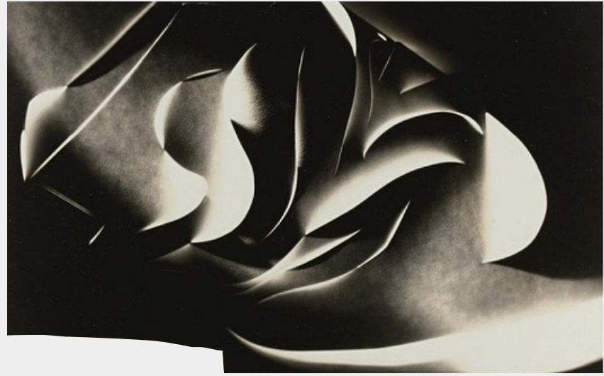
cut-paper abstraction: Francis Bruguiere