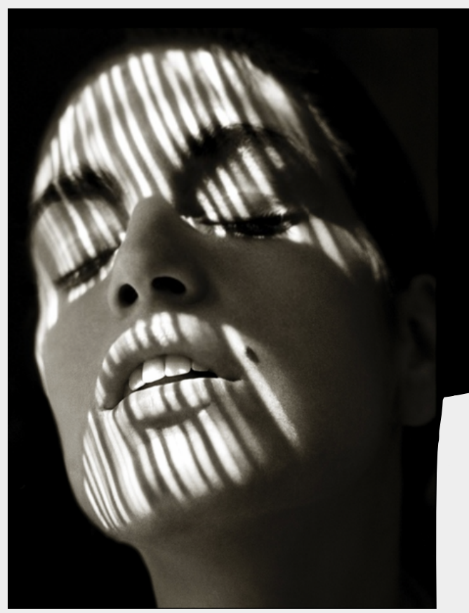
Cindy Crawford in Shadows, 1989: Albert Watson