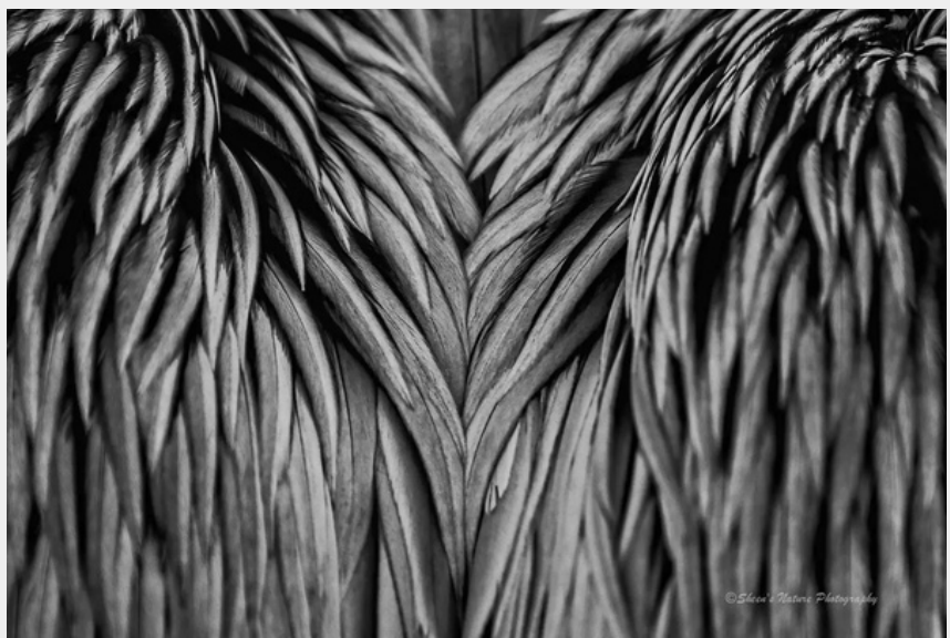
Sheen's Nature Photography