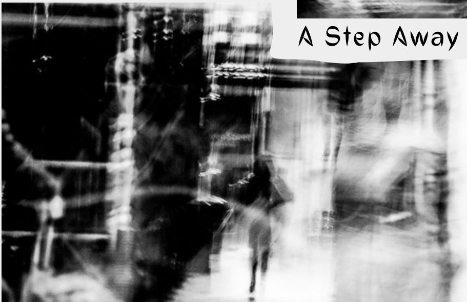
And she Walked Away