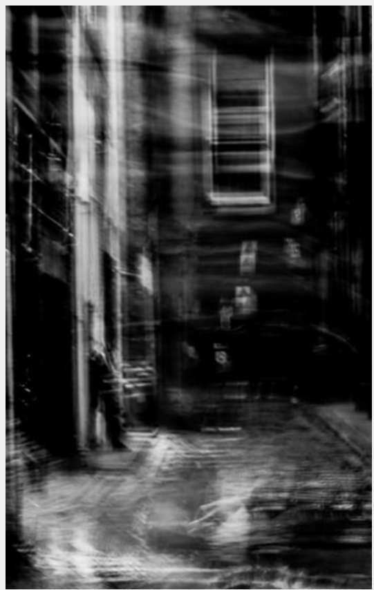
A Step Away