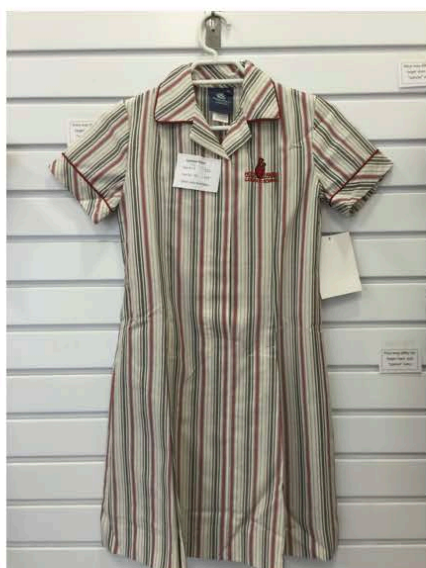
Female Formal Summer Holy Family Summer Dress White HF ankle socks

In Term 4 the Summer uniform should be worn with the school hat.