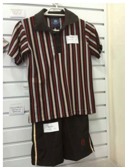
Sports Summer Male and Female Striped HF polo shirt Black Sport shorts with stripe White HF sports ankle socks

Monday - 8.30am to 9.30am Wednesday - 2.30pm to 3.30pm Thursday - 8.30am to 9.30am