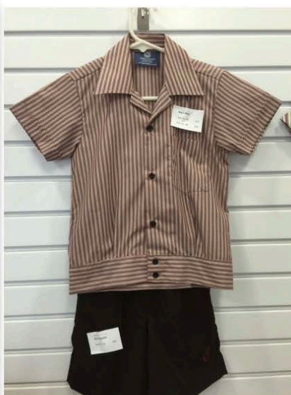
Male Formal Summer Short Sleeve HF striped shirt Black shorts with HF logo Black HF socks

In Term 4 the Summer uniform should be worn with the school hat.