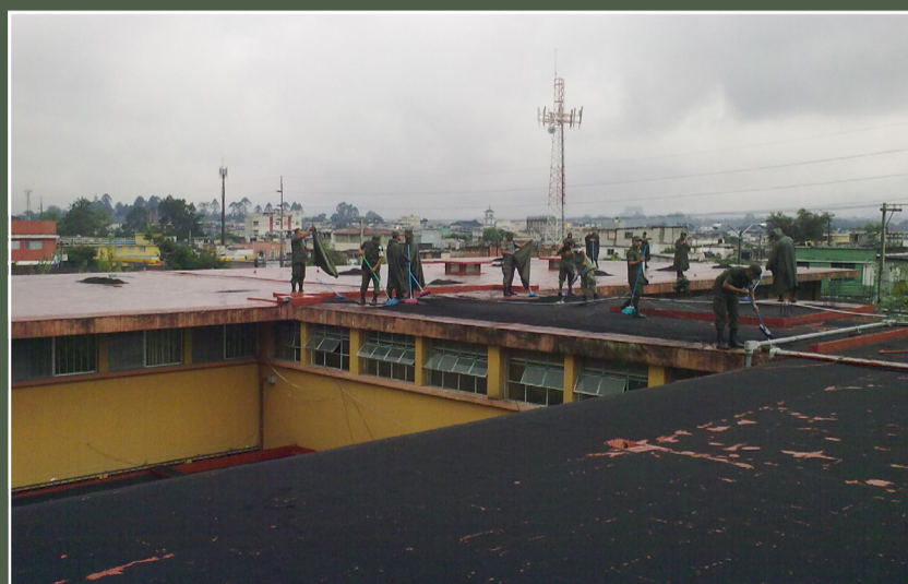
An eruption of Pacaya volcano in 2010 deposited ~20 mm of coarse basaltic ash on Guatemala City. This photo shows cleanup of ash from the roof of a major public hospital. Ash entered gutters and drains, causing flooding. Some abrasion damage to the paint coating on the roof occurred.

Ash cleanup operations create significant additional labour and resource demands.