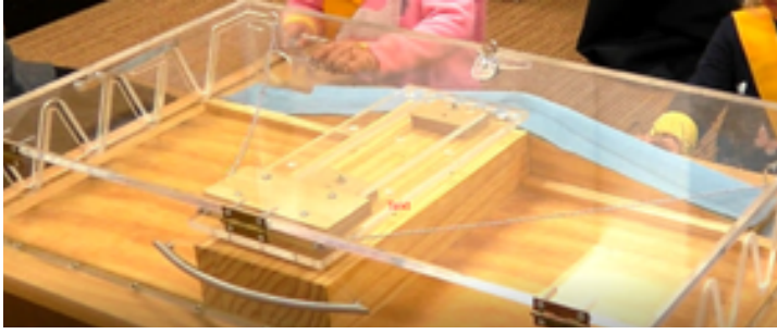
This image features one of our cooperative tasks where two children work together to reach a common goal.

coordinate their physical actions. But this effect was not seen in girls. Our next step is examining whether parents' expectations about boys' and girls' behaviour explain these gender differences. Understanding these complex relationships will help parents and teachers support cooperative development in a way which suits the individual child.