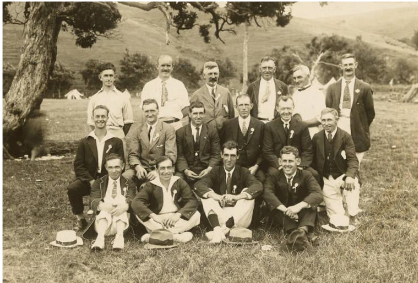
Sugar workers pose for a photo on Motutapu Island at their annual Chelsea Picnic. Auckland Libraries Heritage Collections B0092.

That was one of the greatest things that's ever happened in Birkenhead... The whole of Birkenhead would be on the ferry, and the Birkenhead Municipal Band, and away we'd go. It was a great day. Great sports day. It was really the day of the year to have the sugar company's picnic."