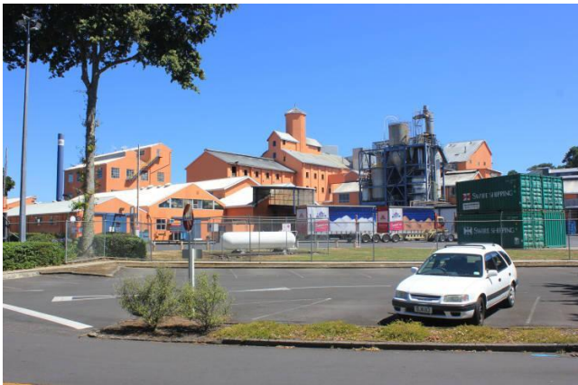
Chelsea Sugar Factory in 2017, with barbed wire fence separating the factory from the public.

What we often overlook - perhaps due to our awe at billowing chimneys and heavy machinery or due to the physical separation often created between these factories and the public by menacing fences which span their circumference - is the fact that these structures are manned and operated by human beings , each with their own personal lives, stories and backgrounds. At Chelsea, this was especially true in the years prior to the 1960s, when manual labour performed much of the work now done by machines. 1 Indeed after World War II, when Chelsea was at its peak employment numbers, over 400 staff worked at the factory. 2 This realisation prompted me to wonder more about the actual individuals working at Chelsea. Who was the Chelsea sugar worker? How did they experience working at Chelsea? And what did they do in their free time? These are the questions I seek to explore in this piece.