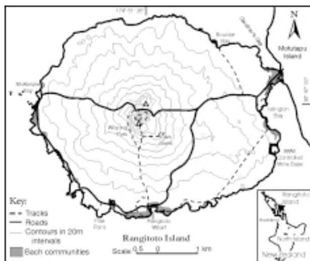
Fig. 1 Location and features of Rangitoto Island.

The forest structure and species associations found in the native vegetation on Rangitoto identifies more closely with the forests of the volcanic Big Island of Hawaii than with any other forest type in New Zealand. The canopy of the Rangitoto forests, like their Hawaiian counterparts, are dominated by trees of the genus Metrosideros (Myrtaceae).