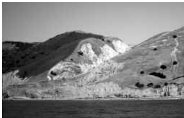
Fig. 3 Sheep fence clearly showing the effects of sheep on the right contrasted with no sheep for approximately 15 years on the left. Santa Cruz Island, California, USA.

In 1994, nine endemic plant species were federally listed as threatened or endangered on Santa Cruz Island. Habitat alteration and soil loss were identified as threats to recovery of all of the listed species (US Fish and Wildlife Service 2000). The last known location of Malacothrix squalida , an endangered annual plant, had been on ESCI in the 1960s (S. Junak, Santa Barbara Botanic Garden; pers. comm.). However, since the removal of the sheep, it is being seen again on ESCI.