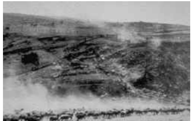
Fig. 2 Sheep round-up circa 1920 on Santa Cruz Island, California, USA.