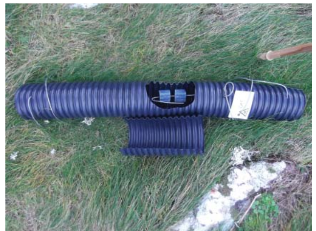
Fig. 4 Example of the main bait station in position showing the open bait station (with the lid off) with the bait wired in place, as used in the five ground-based eradications in the United Kingdom that were directed by Wildlife Management International Ltd.

Although aerial application operations generally have a range of higher implementation costs compared to ground-based operations due to the requirement of a helicopter, sowing bucket and need for ground crew, engineer and other legal requirements for use of aircraft, the implementation time of the operation is often reduced compared to a ground-based operation. Except for the Lundy Island eradication (which took a second winter),