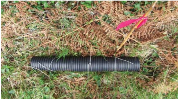
Fig. 1 Example of the main bait station in position with the crow clip holding the central lid in place, as used in the five ground-based eradications in the United Kingdom that were directed by Wildlife Management International Ltd.