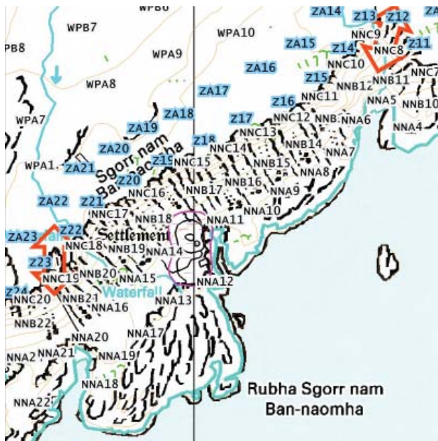
Fig. 2 An example of a detailed bait station map as used by eradication teams during the Isle of Canna operation. Where alphanumeric codes related to bait station positions (e.g. WP = West Plateau, A = line A, 9 = bait station 9; Z = Boundary line Z (two lines of stations at the top of the cliff section above the coastal slopes), 19 = bait station 19; NN = Nunnery, B = line B, 6 = bait station 6), double ended red arrows = safe access routes up or down to the coastal slope areas, pink shaded areas = important archaeological site (e.g. The Nunnery).