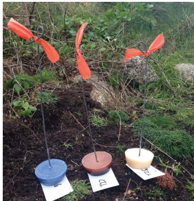
Fig. 5 Examples of flavoured wax as used for monitoring in the five ground-based eradications in the United Kingdom that were directed by Wildlife Management International Ltd. [Credit: Jaclyn Pearson, RSPB]. Where the left (blue) block is aniseed flavour, centre (brown) block is chocolate flavour and right (fawn) block is peanut flavoured and each block is pegged to the ground with a piece of fencing wire and marked with a short piece of flagging tape for visibility.

The costs of these five ground-based eradications ranged from £76,000 up to £900,000, including planning, implementation, key species pre-and post-eradication monitoring, monitoring for survivors or incursions for two